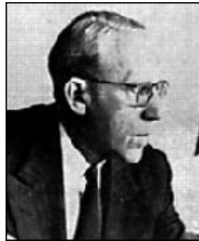
Dr. Fredric Wertham

experience the period. If I could have asked for more, it would have been further commentary from the records of Dr. Fredric Wertham, the psychiatrist who studied Fish in depth.